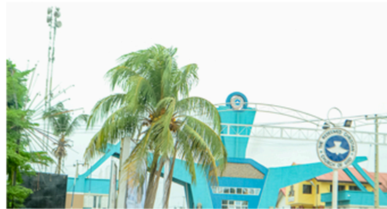
RCCG Redemption City