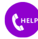
Property Advisory Services

We are a privately owned asset and property management, development and investment company, operating in Lagos Nigeria with over 11 years' experience in the real estate industry. Our track record speaks for us as we have delivered authentic and rewarding property investment services to several individuals, corporate bodies and Real Estate Developers.