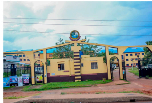
Otedola College of Education, Epe