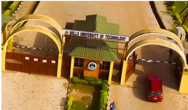
Bells University of Technology, Ota