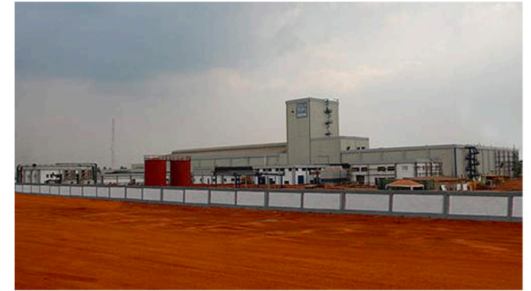
Nestle foods factory, Owode Ofada