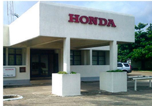
Honda Manufacturing Company Ota/Idiroko Expressway