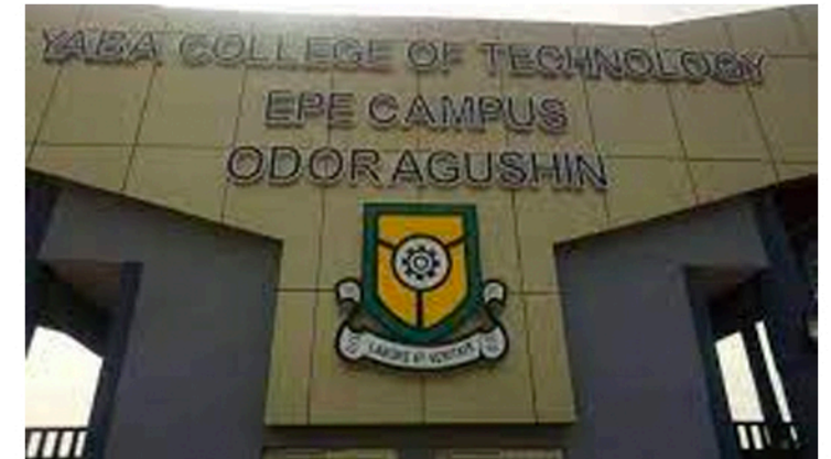
Yaba College of Technology, Epe