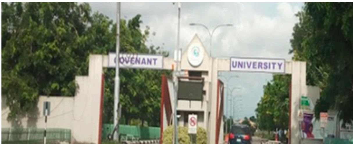
Covenant University, Ota